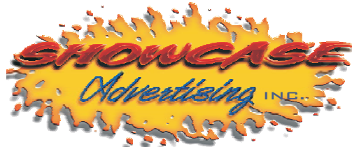
PHOTO ADS • PRINTING • INVITATIONS BUSINESS CARDS • SIGNS • BANNERS

207 S. WALNUT ST. • STARKE, FLORIDA 32091