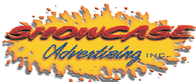
PHOTO ADS • PRINTING • INVITATIONS BUSINESS CARDS • SIGNS • BANNERS

207 S. WALNUT ST. • STARKE, FLORIDA 32091