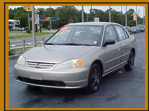
2002 HONDA CIVIC LX MODEL, 1.7I, AUTOMATIC TAN INTERIOR, 4 DOOR