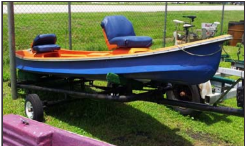
13 Ft. GHEENOE BOAT & TRAILER $450 CALL 904-964-2974.