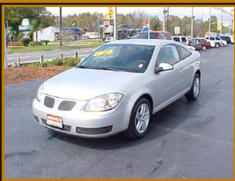
2007 PONTIAC G5 SPORTY COUPE WITH GREAT MPG!! SERVICED AND READY TO CRUISE

24/24 Service Agreement Available On All Our Vehicles