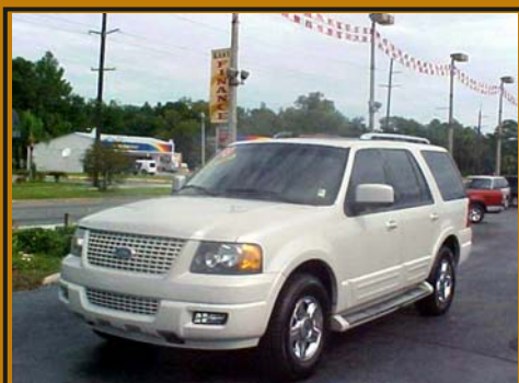
2006 FORD EXPEDITION LIMITED SUV V8, AUTOMATIC, WHITE, TAN INTERIOR