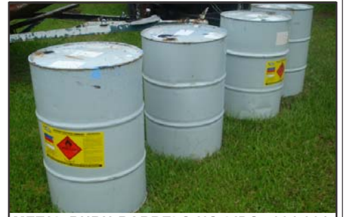
METAL BURN BARRELS NO LIDS 904-964-2974.

Backhoe, Dozer, Augers, Concrete Equipment, Tractor & Bushhog, Yard Tillers, Trenchers, Pressure Washers, Mini/Mid Size Excavators Stump Grinder Zero Turn Lawnmowers and more!