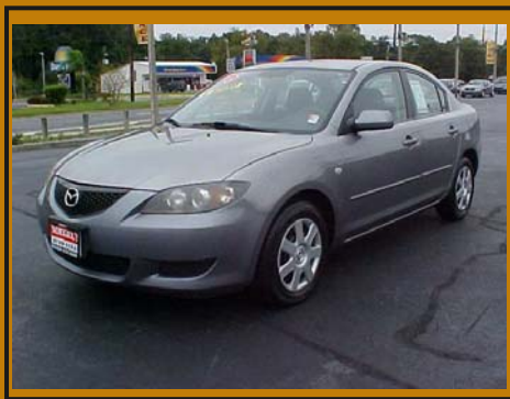
2006 MAZDA 3 SUPER GAS SAVER!!! 5 SPEED MANUAL TRANS 2.0I DOHC 16V 4 CYLINDER