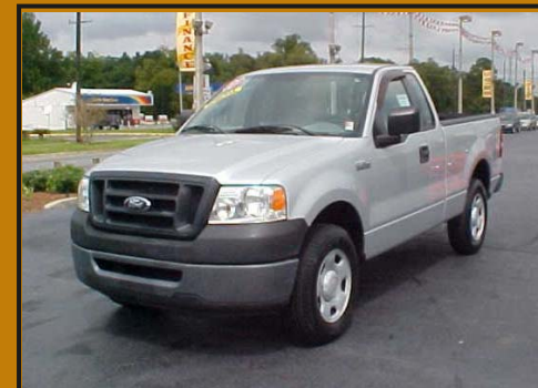
2007 FORD F-150 XL MODEL, 4.2I, AUTOMATIC, VERY NICE TRUCK!!