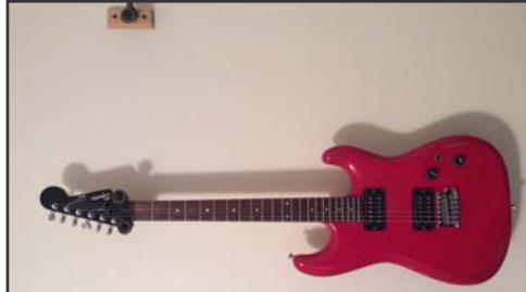
RED 1985-86 FENDER SQUIER STRATOCASTER, A SERIES, RARE DOUBLE HUMBUCKER PICKUPS. VERY GOOD CONDITION $400 941-915-8256.