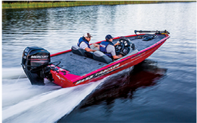
#1 selling aluminum fishing boat

2014 Tracker ProTeam 175 w/Trail Star Trailer & 60HP Mercury includes Loranx Fish Finder includes Minnkota trolling motor National Price - $15,995*