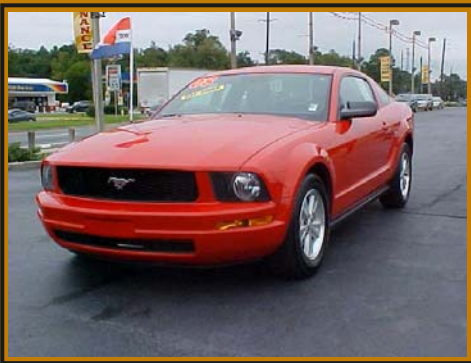
2008 FORD MUSTANG LOW MILES, 4.0 LITER V6, 5 SPEED MANUAL TRANS, POWER WINDOWS.

Take 60 seconds and we could have you driving in hours!