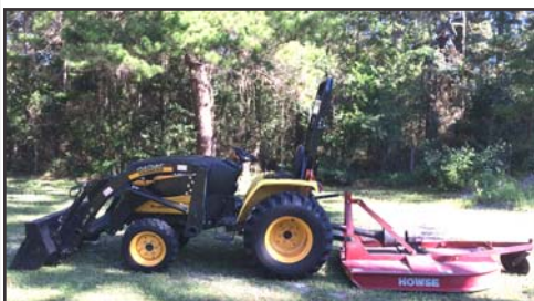
2011 YANMAR CUB CADET EX2900 4WD, FRONT LOADER, 5' HOWSE BRUSH MOWER, 5' BOX BLADE $12,500 904-528-8197.