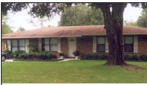
FOR SALE BY OWNER: 3BR, 1 1/2 BA ALL BRICK HOME, GARAGE ENCLOSED FOR LARGER LR, NEW AC UNIT, 10x16 LARK SHED, LANDSCAPED, YARD FULLY FENCED WWW.781GLENDALE.WEBLY.COM 904-406-0439 or 352- 235-1285 $140,000