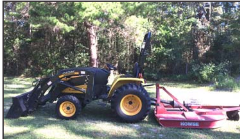
2011 YANMAR CUB CADET EX2900 4WD, FRONT LOADER, 5' HOWSE BRUSH MOWER, 5' BOX BLADE $12,500 904-528-8197.