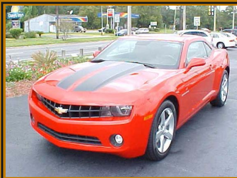
2011 CHEVROLET CAMARO SUPER NINE VICTORY RED, ALL OPT., PWR. LEATHER SEATS...AWESOME CAR!!