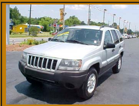
2004 JEEP GRAND CHEROKEE 4 DR., SILVER, GREAT MEDIUM SIZE FAMILY VEHICLE