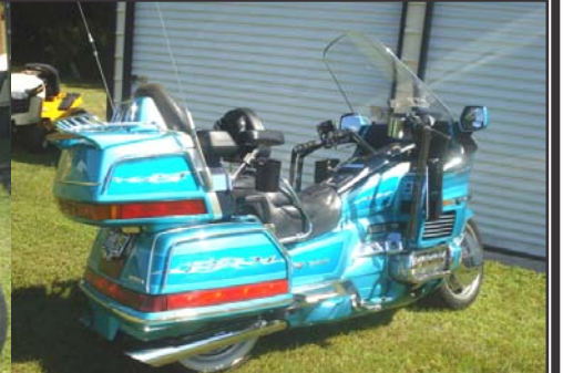
1994 HONDA GOLDWING 1500cc, 66,098 MILES, GARAGE KEPT, EVERYTHING WORKS GREAT, SELLING DUE TO HEALTH ASKING $7000 OBO 904-368-1241.