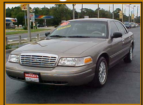
2005 CROWN VICTORIA LX TRIM, 4.6 , AUTOMATIC, GOLD INTERIOR, 4 DOOR

24/24 Service Agreement Available On All Our Vehicles