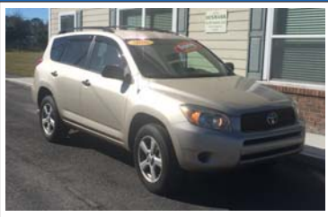
2006 TOYOTA RAV4