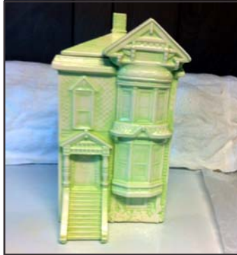
Ceramic "Townhouse" cookie jar, light pastel green. Great for real estate office 352.235.1898