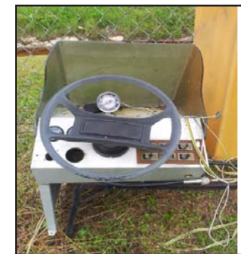
BOAT CONSOLE $125 OBO 964-2974