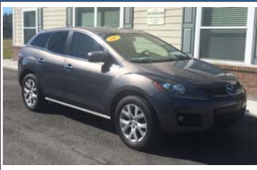
2007 MAZDA CX-7