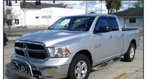
2013 RAM 1500 SILVER, 22,026 ACTUAL MILES, VERY GOOD CONDITION, OVER $1500 IN EXTRAS. BLUE BOOK sell $25,000 trade $22,269 ASKING $20,500 904-964-7457