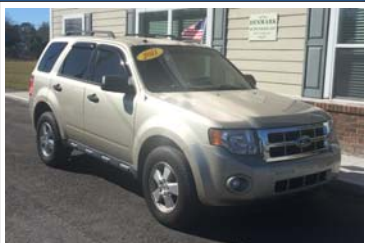
2011 FORD ESCAPE