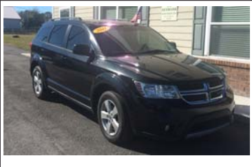
2011 DODGE JOURNEY