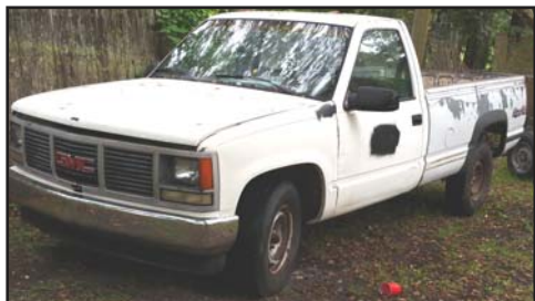
1988 CHEVY PICK UP 3/4 TON, 2 WD, V8, 126K MILES, RIDE & DRIVE $1500 904-769-9754.