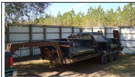
GOOSENECK TRAILER, 20 FT, 3 AXLE WITH RAMPS $1500 904-449-1763

We Rent and Sell Tools & Equipment for Homeowners & Contractors