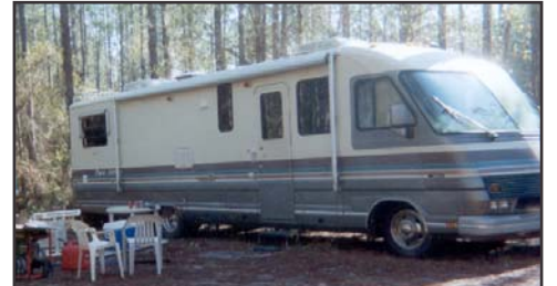
1990 PACE ARROW 34', 454 GAS MOTORHOME WITH NEW MICHELIN TIRES $3500 352-468-2759 OR 352-256-6634