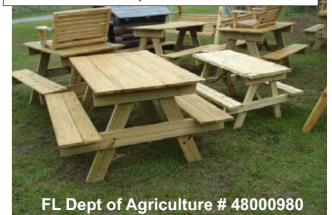
FL Dept of Agriculture # 48000980

5 ft. Slab Picnic Table Water Proofed, P.T. $125. ea.