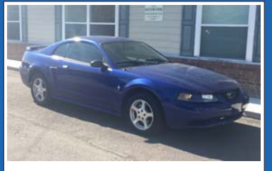
2003 FORD MUSTANG