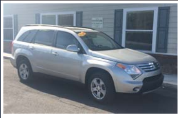
2006 SUZUKI XL7