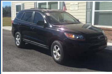
2008 HYUNDAI SANTA FE GLS