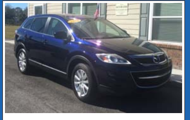
2010 MAZDA CX-9