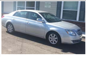
2006 TOYOTA AVALON