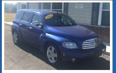
2006 CHEVY HHR LT