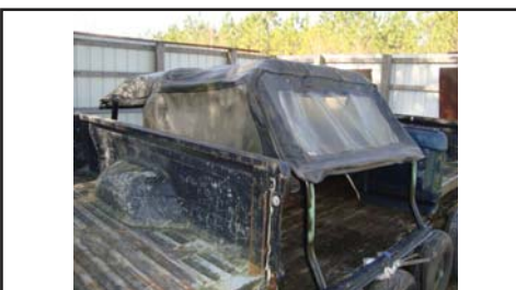
67-77 BRONCO CANVAS TOP WITH BARS $450 904-449-1763