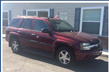
2005 CHEVROLET TRAILBLAZER