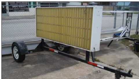
Changeable Letter Sign on wheels, rent it and make extra money on wall... NOS...$225 904-263-0008

Monthly Classes at Bradford Sportsmens Farm Graham, FL Call: 352-481-2005