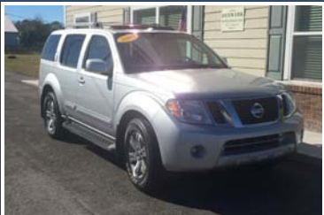
2009 NISSAN PATHFINDER LE

Financing Available • Guaranteed Credit Approval