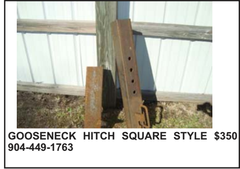
GOOSENECK HITCH SQUARE STYLE $350 904-449-1763