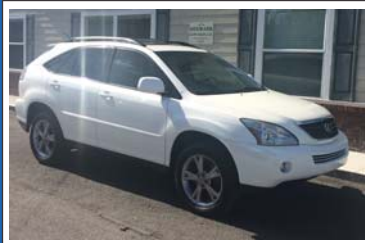
2006 LEXUS RX 400H