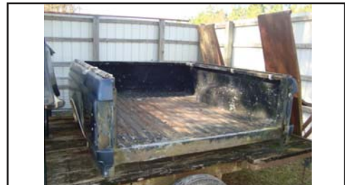
87-92 FORD SHORT BED DUAL TANK $450 904-449-1763

SUPER A TRACTOR WORKING HYDRAULICS CULTIVATING ARMS CRANKS FIRST TIME $1995 904-449-1763