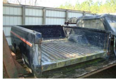
87-92 FORD SHORT BED SINGLE TANK $450 904-449-1763