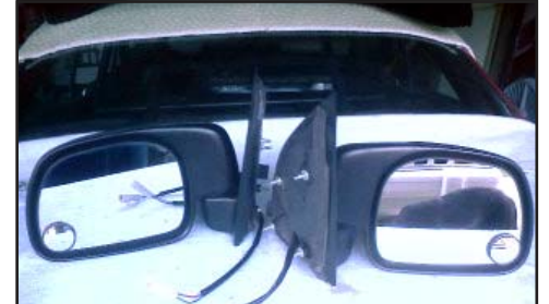
POWER MIRRORS FOR 1999-2001 F250 FORD $120 CALL 904-687-6908