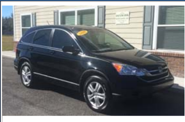
2010 HONDA CRV EXL