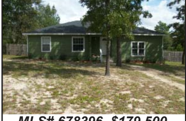
MLS# 678396 $179,500

Very well maintained 3BR/2BA home on a quiet street. This fully fenced home has a gleaming pool and perfect patio for summer entertaining. The home has beautiful hardwood floors, is open bright and light. The family room opens to the pool and the nicely landscaped yard.