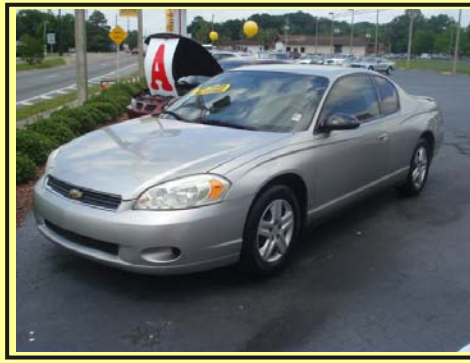
2006 MONTE CARLO LS V-6, AUTO