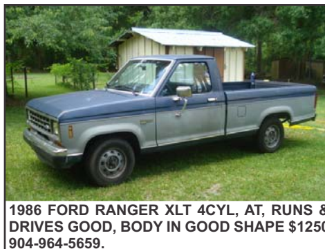
1986 FORD RANGER XLT 4CYL, AT, RUNS & DRIVES GOOD, BODY IN GOOD SHAPE $1250 904-964-5659.

* No Haggle No Hassle retail price for model and engine listed, Zone 2 Freight, Retail price does not include freight or rigging, with approved credit payments at 4.99% financing for 120 months. +Money down equal to any amount over m.s.r.p to establish advertised payment. Local taxes, license, registration and doc fees, in addition to prices shown. Offer available for well-qualified buyers on select models. Subject to credit approval; not all customers will qualify. See Polaris of Gainesville for eligibility and complete details.