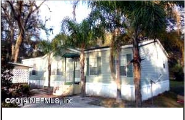
MLS# 700635 $74,900

Great location just blocks from St Johns River State College, 4BR, 2BA, 2 pantry closets, lots of counter tops.