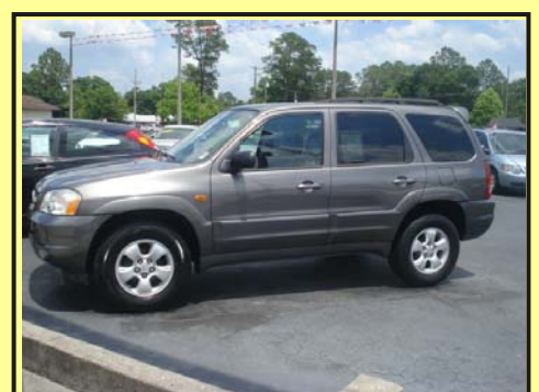
2004 MAZDA TRIBUTE ALL POWER, 4X4, V6, LEATHER