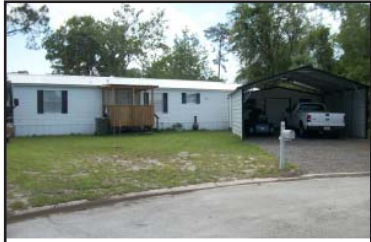
MLS# 664294 $59,900

Priced to sell and it is ready to move in more importantly. All on 1.25 acres. Both bathrooms remodeled. Master Suite tub removed, could be put back, (plumbing in wall) or extend the closet in that area. Lots of concrete nice patio area.