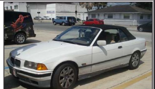
1995 BMW 325i CONVERTIBLE, 110K MILES, DRIVEN DAILY $2750 OBO CALL ANYTIME 904-769-9754.