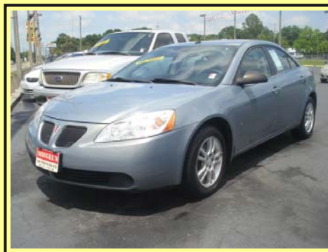
2008 PONTIAC G6