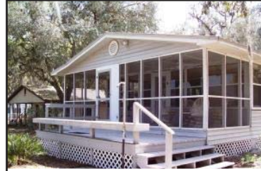
MLS# 711452 $82,000

2580 SF 4BR, 2BA with FP, split floor plan, fenced back yard, 2 storage buildings, quiet location.