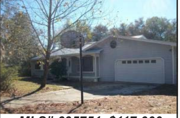
MLS# 695751 $117,000

Looking for waterfront acreage? Here it is! Very nice trees on this 10.08 acre lot only one parcel off paved road. Easy commute to Gainesville or Palatka. Just a corner of the property is on Lake Higginbotham per plat map. Come see this beautiful property today!