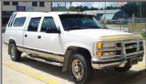
1999 CHEVY 2500 LS, 4 DOOR, 7.4L, WHITE W/RED CLOTH INTERIOR, TOW, FL TOPPER, HAND RAILS, ALLOY WHEELS, FULL SIZE SPARE, 45,600 MILES, RARELY DRIVEN, 2nd OWNER $9,800, NOW $9500 904-263-0919