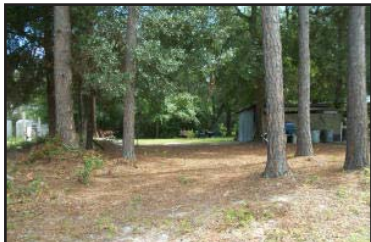
MLS# 679093 $6,500

Very nice treed lot on Halfmoon Lake. Has old Mobile Home no value given and possible old improvements. Priced for a quick sale, cash only AS IS. Easy drive into Keystone or Palatka.