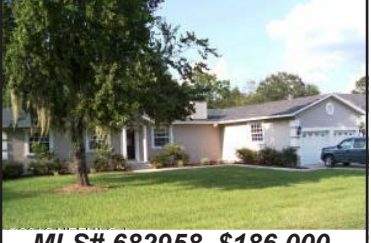
MLS# 682958 $186,000

Very nice custom built home with salt water pool that has full decking all the way around. Home has nice mix of tile and laminate flooring. Split bedrooms. Complete with over size bonus room. Fenced in back yard.