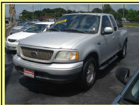
2003 F150 SPORT SIDE 3 DR, V6, AUTO, LOW MILES