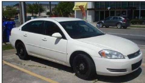
2007 CHEVY IMPALA, AC, CD, 110K MILES $4000 OBO SERIOUS INQUIRIES ONLY PLEASE CALL ANYTIME 904-769-9754.