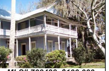
MLS# 708438 $100,000

Like New 3/2 CB home in Brooker. Many upgrades have been done. Oversized parking pad, fenced backyard, separate workshop.