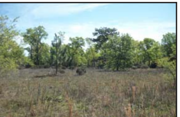
MLS# 711687 $35,000

Come enjoy this improved lot or build your new home. No warranties given on well, septic or dock.