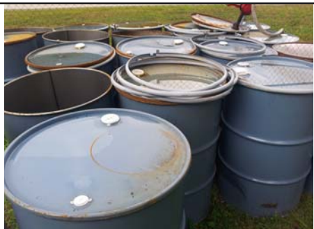
BARRELS WITH RIMS CALL ME 964-2974.