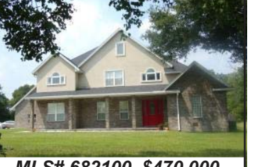
MLS# 682100 $470,000

Starke: 4000 SF building for your business in great location.