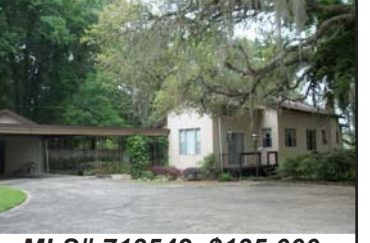
MLS# 713542 $135,000

This 20+/- acres would make a great farm/ranch estate, or for the investor a great subdivision, zoned RSF/MHI which allows 1 MH per half acre, also Flood zone X, and no wetlands per zoning. Power line easement through west end of property