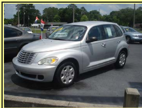
2006 PT CRUISER AUTO, GREAT GAS SAVER