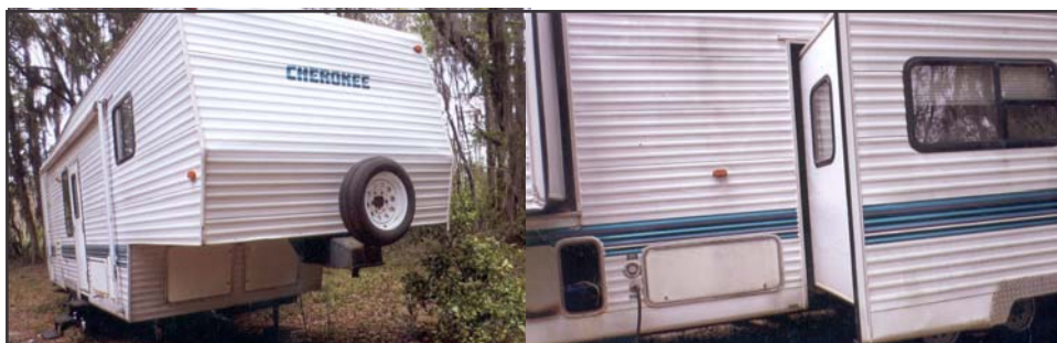
1999 CHEROKEE 5th WHEEL, NEW METAL ROOF, COLD AIR, NEW AWNING, NEW TIRES, GOOD CONDITION, 2 SLIDE OUTS $6000 OBO SELLING DUE TO HEALTH PROBLEMS 352-475-5897