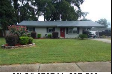
MLS# 679744 $97,500

Move in ready 2003 Manufactured home on 5 acres. Beautiful deck, wood burning fireplace and partially fenced. Property has a second septic system.