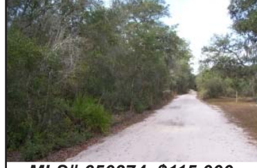
MLS# 650374 $115,000

Victorian classic home zoned B2 could be professional office, residential etc. Home has been largely restored. Lovely open verandahs & porches, 100 yr old palms.