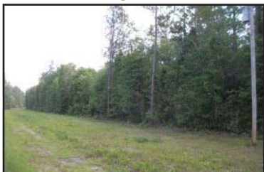
MLS# 620219 $11,000

Very nice treed lot on Halfmoon Lake. Has old Mobile Home no value given and possible old improvements. Priced for a quick sale, cash only AS IS. Easy drive into Keystone or Palatka.