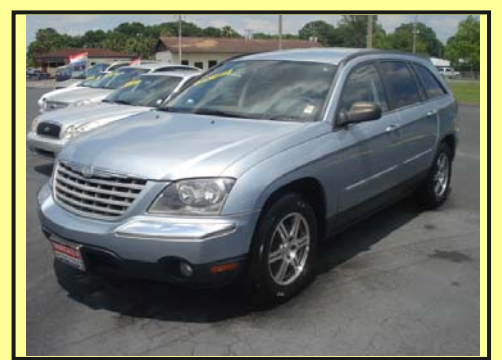
2005 CHRYSLER PACIFICA