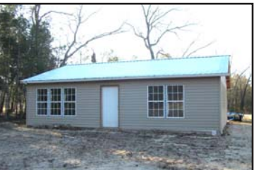
MLS# 704534 $39,900

Nice parcel, high and dry. Zoned for building a home or manufactured home. Partially cleared.