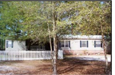
MLS# 709577 $77,000

Like new 1999 SWMH is a recent addition to neighborhood and has not been occupied at this location. Large yard is fully fenced. CH/A. Close to Crosby Lake boat ramp. Home next door is also for sale by same seller.