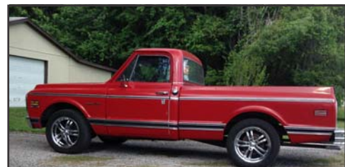
1971 CHEVY C10, SWB, FACTORY AC, TILT WHEEL PS, PB, AT OVERDRIVE, 15,000 MILES ON 350 CHEVY CRATE MOTOR FROM CHEVY DEALER. $12,000 904-782-3956.