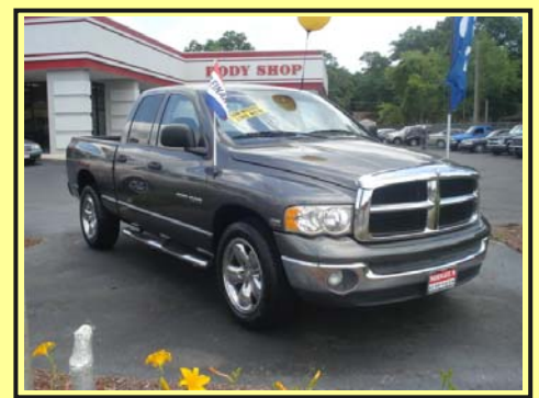
2003 DODGE RAM 1500 4 DR. HEMI, AUTO, LOW MILES