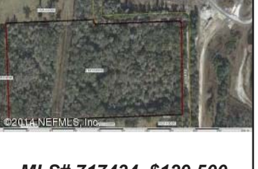
MLS# 717434 $129,500

Charming 3BR, 2 1/2 BA brick home on corner lot. FP, deck, home has been updated to be more energy efficient.