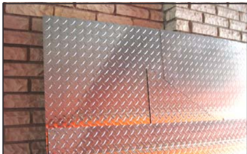
SCRAP ALUMINUM DP .063 THICKNESS VERY BRIGHT FINISH CALL FRANK FOR SIZE 263-0008