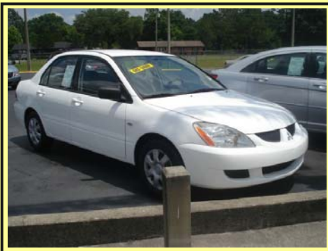
2004 LANCER ES

24/24 Service Agreement Available On All Our Vehicles