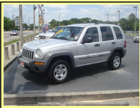
2003 JEEP LIBERTY LEATHER, V-6, AUTO