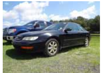
1998 ACURA 3.0CL PREMIUM $4,990 STK#: 12608