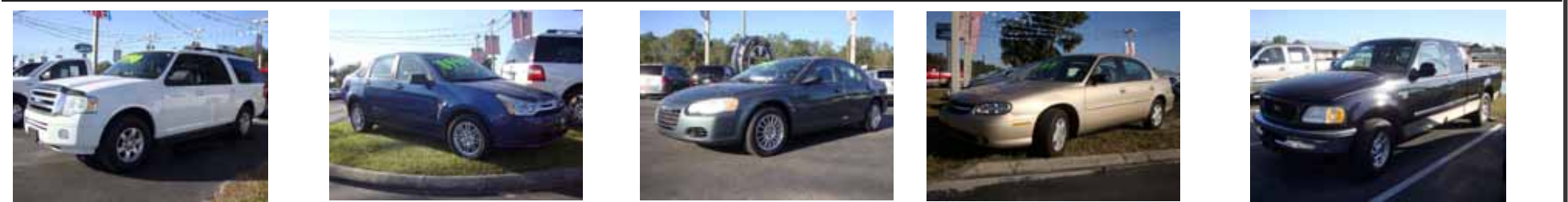
2009 FORD EXPEIDITION EL XLT $13,990 STK#: A06640