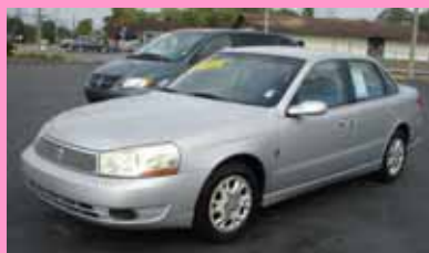
2003 SATURN L200 $499 DWN