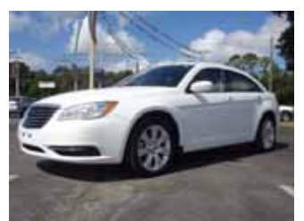
2012 CHRYSLER 200 LX $15,990 STK#: 184343