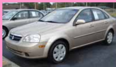
2008 SUZUKI FORENZA $499 DWN