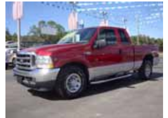
2002 FORD F-250 $9,990 STK#: A34232