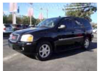
2007 GMC ENVOY SLT $14,990 106551