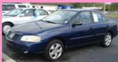
2006 NISSAN SENTRA $499 DWN