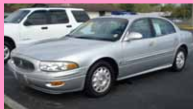
2002 BUICK LASABRE $499 DWN