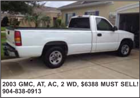
2003 GMC, AT, AC, 2 WD, $6388 MUST SELL! 904-838-0913