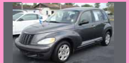
2004 CHRYSLER PT CRUZIER $499 DWN