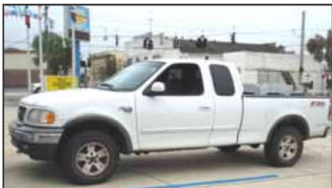
2003 FORD F150 Fx4 LOADED, 4 DOOR, 230,000 MILES, WELL MAINTAINED, NEW TIRES, EXCELLENT CONDITION $5999 904-964-8085