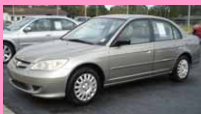
2005 HONDA CIVIC $499 DWN