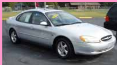
2002 FORD TAURUS $499 DWN