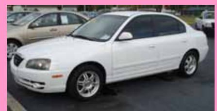
2006 HYUNDIA ELANTRA $499 DWN