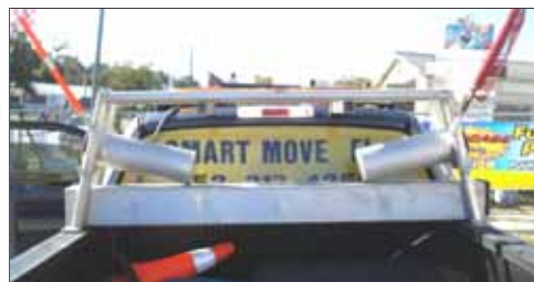
ALUMINUM RACK FOR ESCORT SERVICE: HOLDS SIGNS, FIRE EXTINGUISHER & FLAGS $150 352-317-4250.

*No Haggle No Hassle retail price for model and engine listed. Zone 2 Freight. Retail price does not include freight or rigging, with approved credit payments at 4.99% financing for 120 months. *Money down equal to any amount over m.s.r.p. to establish advertised payment. Local taxes, license, registration and doc fees, in addition to prices shown. Offer available for well-qualified buyers on select models. Subject to credit approval; not all customers will qualify. See dealer for eligibility and complete details.