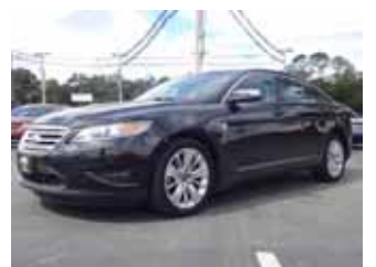
2011 FORD TAURUS LIMITED $15,990 STK#: 118279